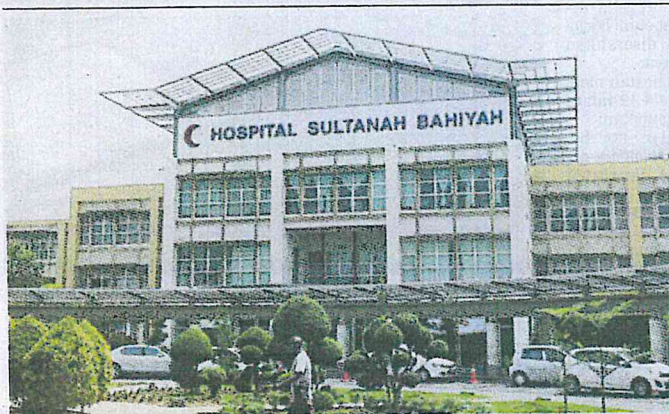
Hospital Sultanah Bahiyah, Alor Setar memberikan rawatan kepada wanita dijangkiti COVID-19 yang kini pulih sepenuhnya.

Mengulas situasi semasa COVID-19 di Malaysia, Dr Noor Hisham berkata, KKM sudah memperkukuh pemantauan menggunakan konsep yang dilaksanakan bagi pengesanan kes jangkitan pernafasan akut teruk (SARS) dan penyakit seperti influenza (ILI).