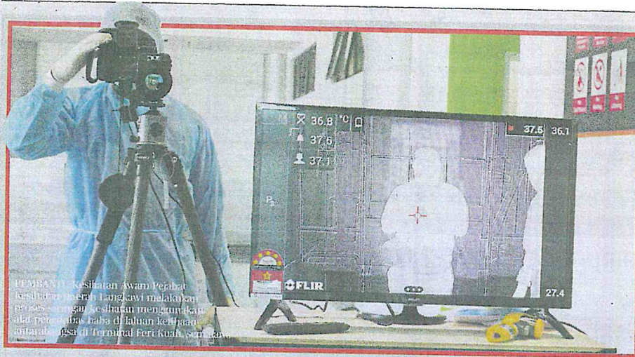
PEMBAKIT Kesihatan Awam Pejabat Kesihatan Daerah Langkawi melakukan proses screening kesihatan menggunakan alat pengukur suhu di laluan kedatangan antara gesa di Terminal Feri Kuala Perlis.