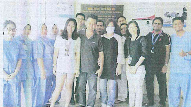
Pesakit Covid-19 ke-13 (depan, empat dari kanan) ketika dibenarkan keluar dari wad isolasi Hospital Sultanah Bahiyah, Alor Setar kelmarin.

"Pengalaman kali ini membuktikan bahawa hospital kerajaan mampu memberi perkhidmatan yang berkualiti dan bertaraf tinggi. Rakyat Malaysia patut berbangga dengan pencapaian tersebut," katanya.