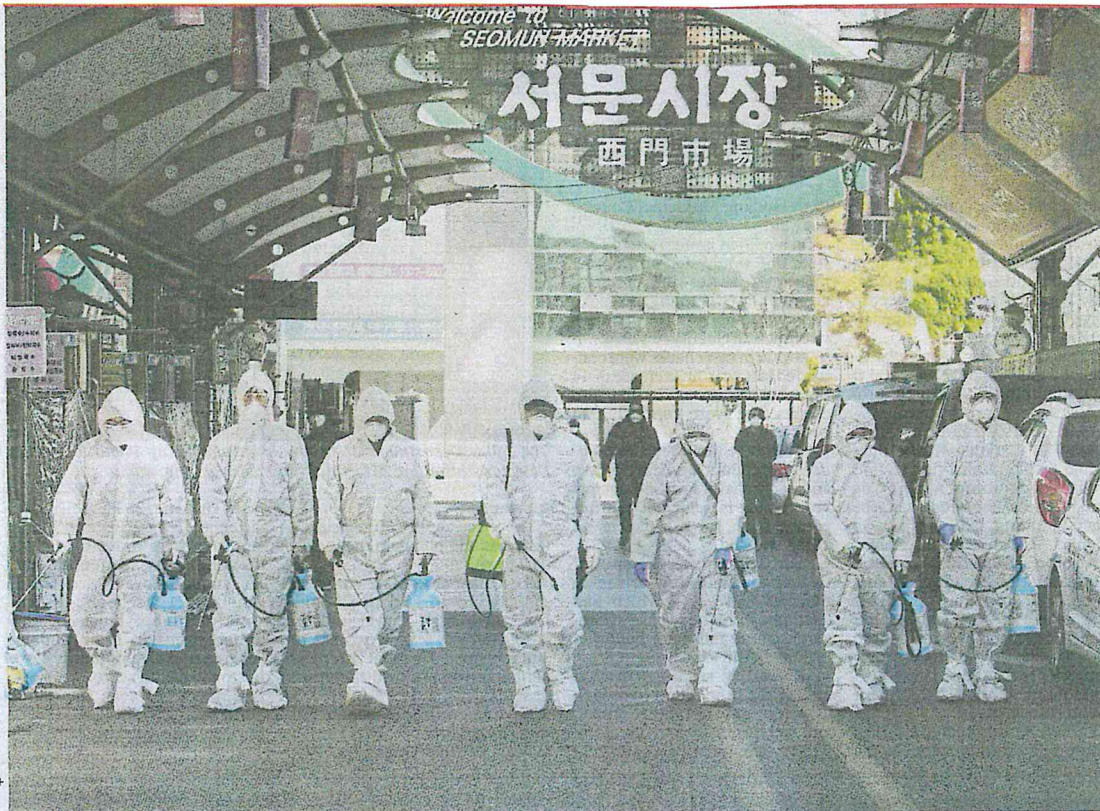
Market workers spraying disinfectant at a market in the southeastern city of Daegu in South Korea yesterday.