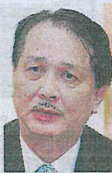
Datuk Dr Noor Hisham Abdullah

"Out of 22 cases, 20 were imported, for example, cases with histories of travel or living overseas, particularly from China.