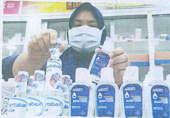
Stocking up: A worker arranging hand sanitisers at a pharmacy. The demand for hand sanitisers has increased since the Covid-19 outbreak.

"Based on the current situation, MOH has proactively strengthened the Covid-19 surveillance system to detect local cases in the community," he said.